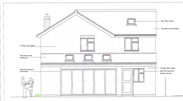
NORTH ELEVATION AS PROPOSED