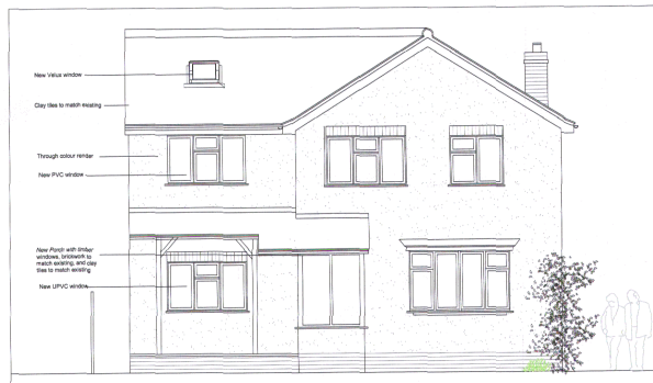
SOUTH ELEVATION AS PROPOSED