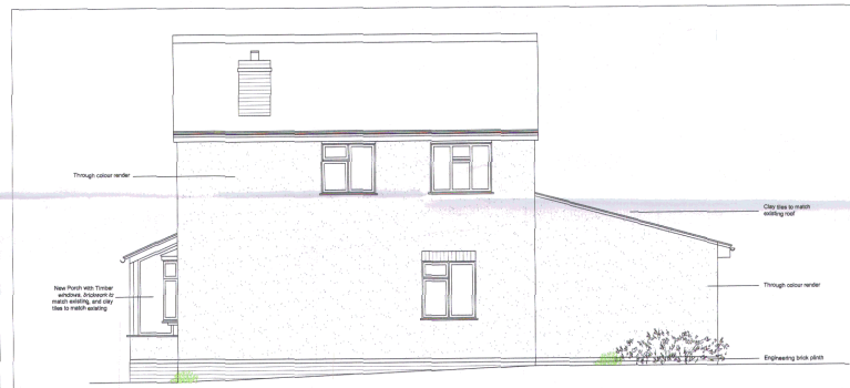
EAST ELEVATION AS PROPOSED